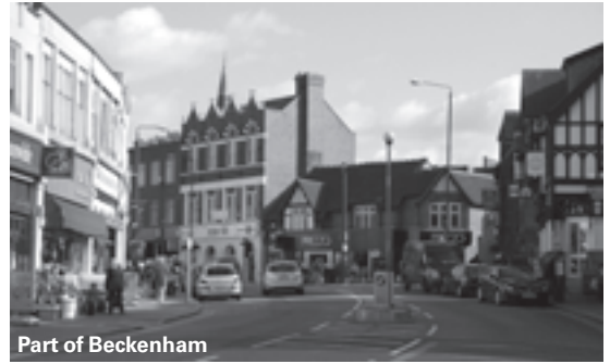
Part of Beckenham

Age (and when founded): Founded 1943 so now celebrating 70 years